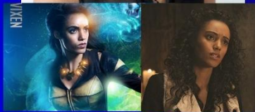
MAISIE RICHARDSON-SELLERS Legends of Tomorrow The Originals