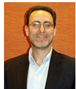
BOB GREENBERGER Author - 100 Greatest Moments of DC Comics